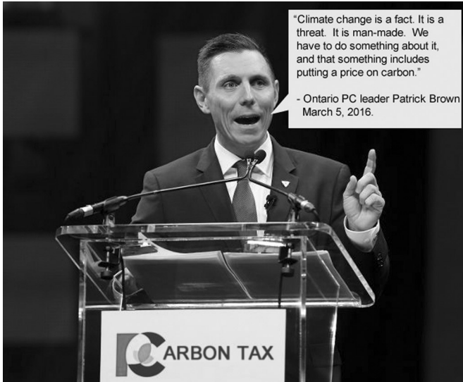
ABOVE: Not right, but left: PCs finally come out of the closet